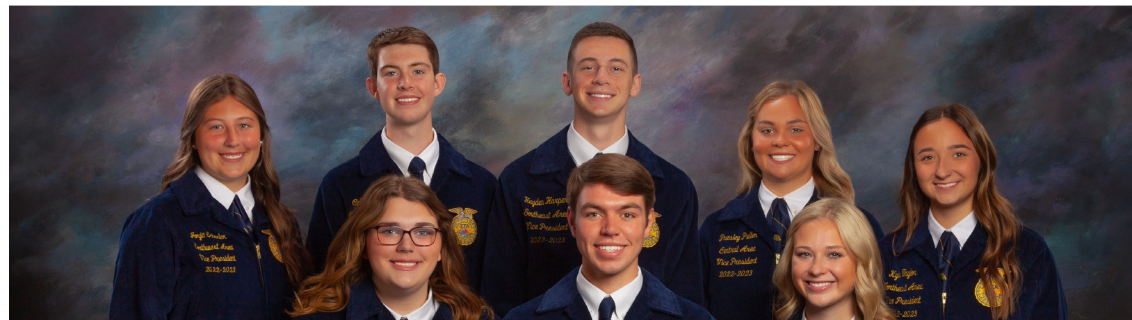
2022-2023 State FFA Officer Team